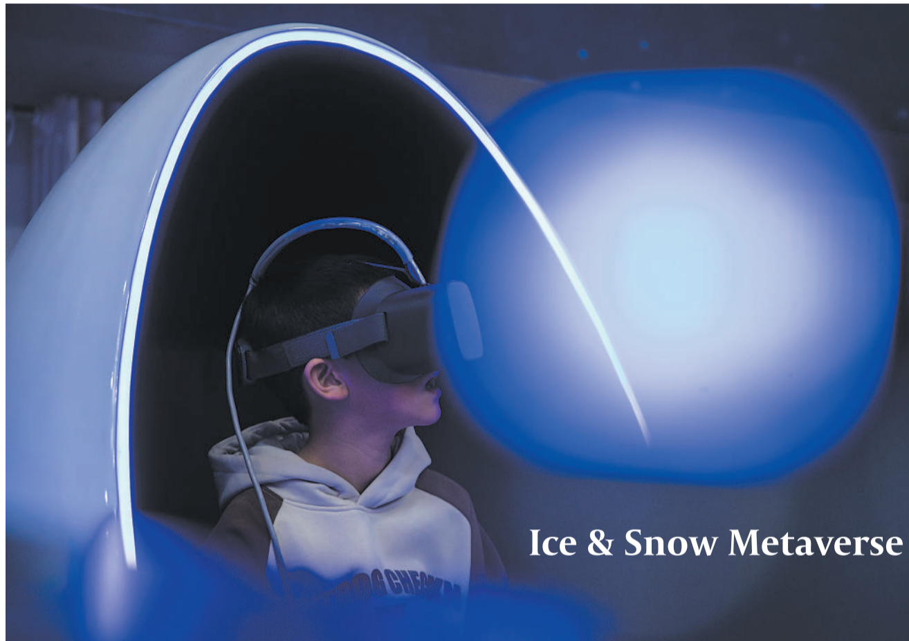
Ice & Snow Metaverse

Projects will be carried out to digitalize agriculture in rural areas, improve the efficiency of rural industries and the quality of public services with digital tools, popularize rural culture through the Internet, and upgrade governance and digital infrastructure, according to the memorandum.